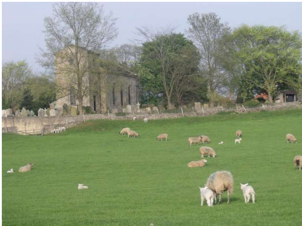
St Peters at Elmton