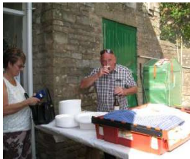
Music by Dream a Little Dream