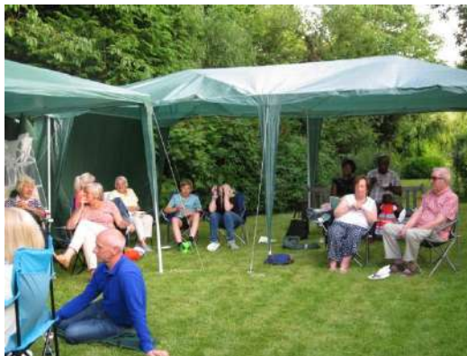
The weather was kind and a good time was had by all.