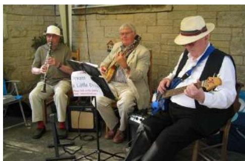
A time to relax and enjoy the surroundings and the company