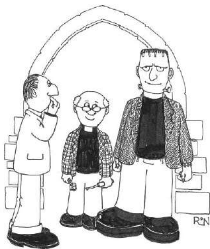
THE ARCHDEACON HAD NO IDEA WHERE COLIN'S NEW CURATE CAME FROM