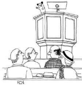
They had been promised a Celebrity Guest Preacher